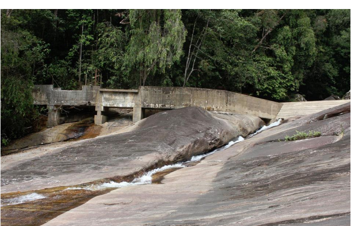
The dam blocking the waterfall

As can be seen from the above recently taken photographs, irreversible damage has already been caused to the protected Sripada Sanctuary and World Heritage site due to this project. In addition to building dams within a protected sanctuary, large endemic trees have been felled down to clear pathway for pipelines. This is a complete violation of the Flora and Fauna Protection Ordinance 1937 (amended 2009) and Forest Ordinance 1908 (amended 1995). Amounting to 12,979 hectares, the Samanala Adaviya was declared as a nature reserve by a gazette notification in September 7, 2007 and is protected by the Flora and Fauna Protection Ordinance (FFPO). Section 3 and 6 of the ordinance strictly forbid any development activity in a nature reserve such as construction of permanent or temporary structures, deforestation, removal of plants, destroy fauna and flora or construction of roads. Samanala Adaviya Nature Reserve (SANR) is one of the five nature reserves in the country and is the richest in bio-diversity with the highest number of endemic species. Because of its exceptional importance, UNESCO declared SANR and the central hills in the country as a natural world heritage site in 2010.