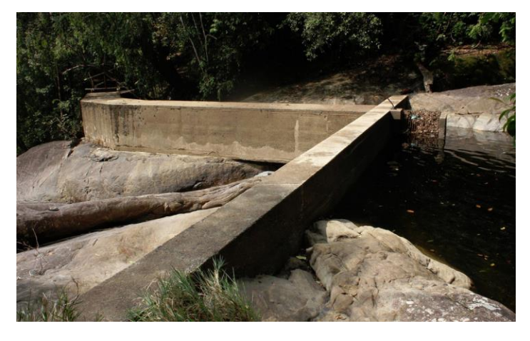
The dam blocking the waterfall