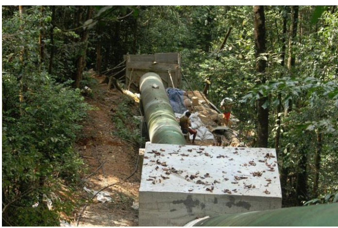
Pipelines at construction site inside Sripada Sanc tuary