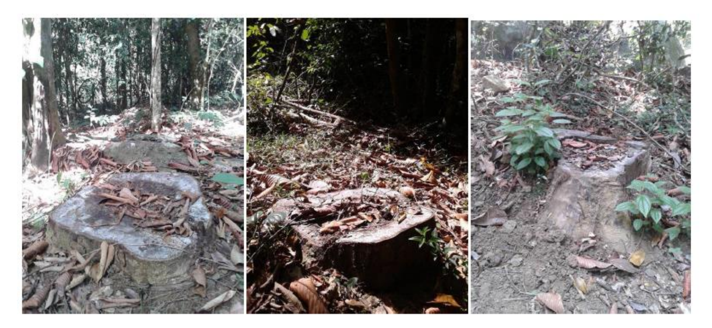
( Hora trees in Udakiruwa Rainforest that have been recently cut down and sold )

Unless the Ministry of Environment and Central Environmental Authority coordinate to immediately take action and declare the Hora tree ( Dipterocarpus zeylanicus ) as a protected species and grant the highest protection, Sri Lanka may soon lose this treasure forever. Legal protection should be followed up with notifying and educating the local authorities such as Grama Niladhari, Divisional Secretariat and District Secretariat offices of relevant areas of the importance and legal protection given to the Hora tree, and the need to preserve it for the future.